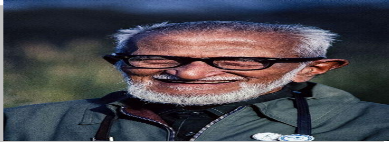
Sálim Moizuddin Abdul Ali ( Bird Man of India)